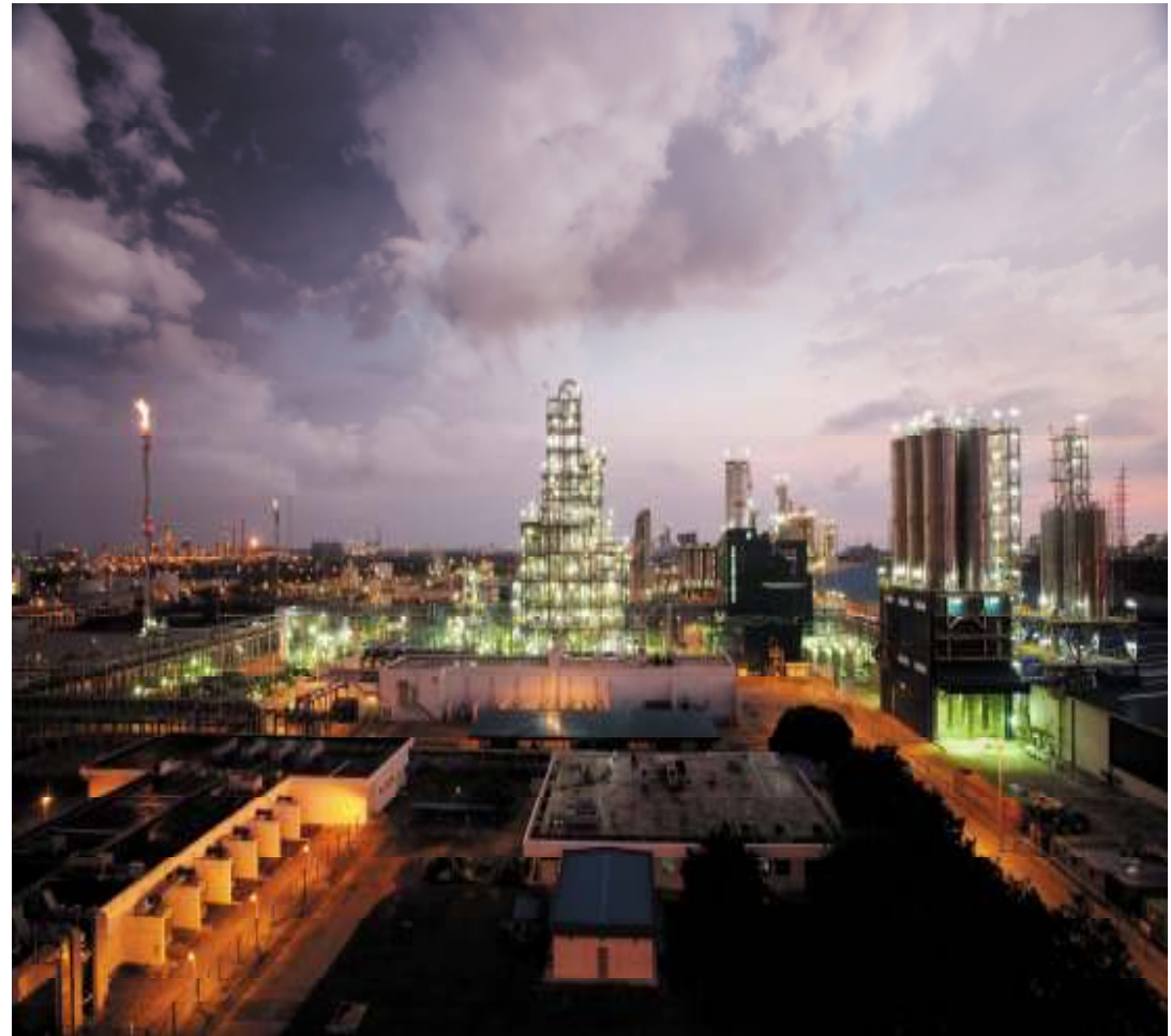
<Thailand, HMC PP Project >